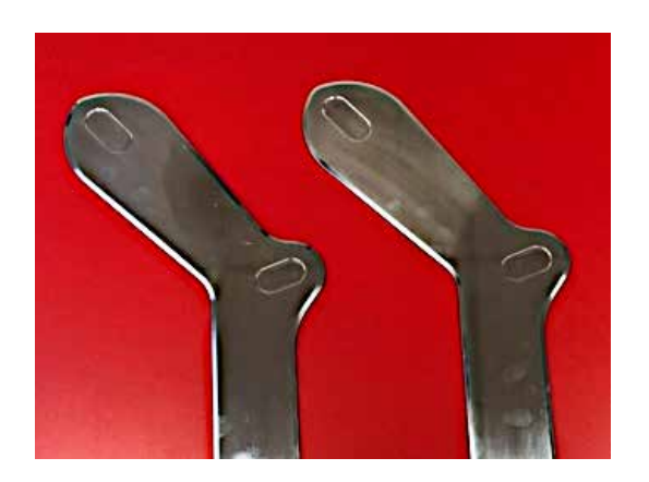
45° foot shape forms